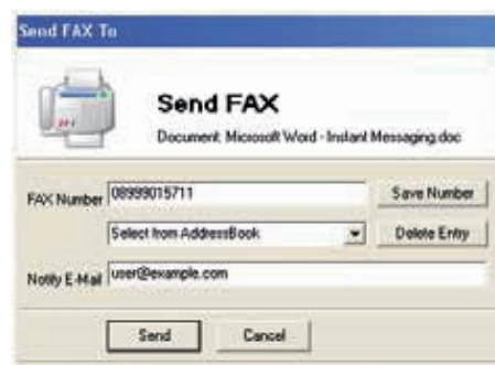
The print function can be used for sending a fax from all applications.